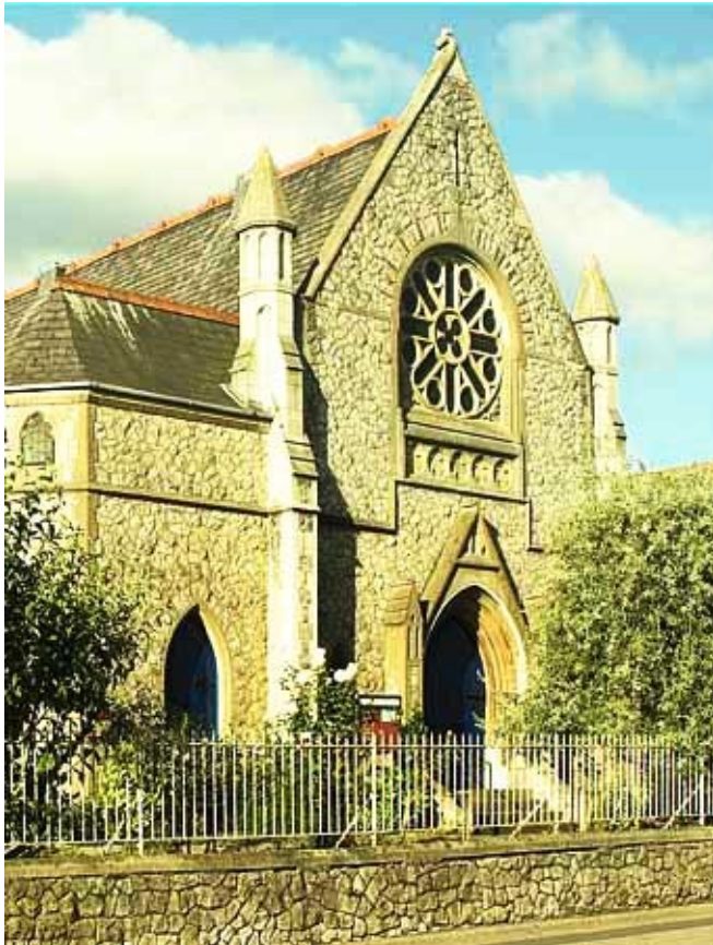
Emmanuel Church Sidcup Methodist and United Reformed