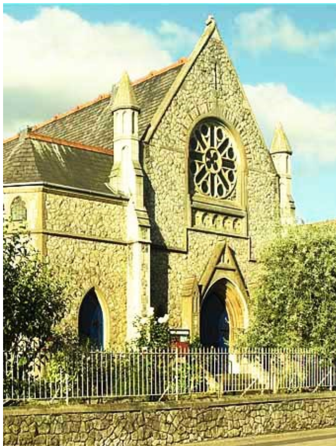
Emmanuel Church Sidcup Methodist and United Reformed