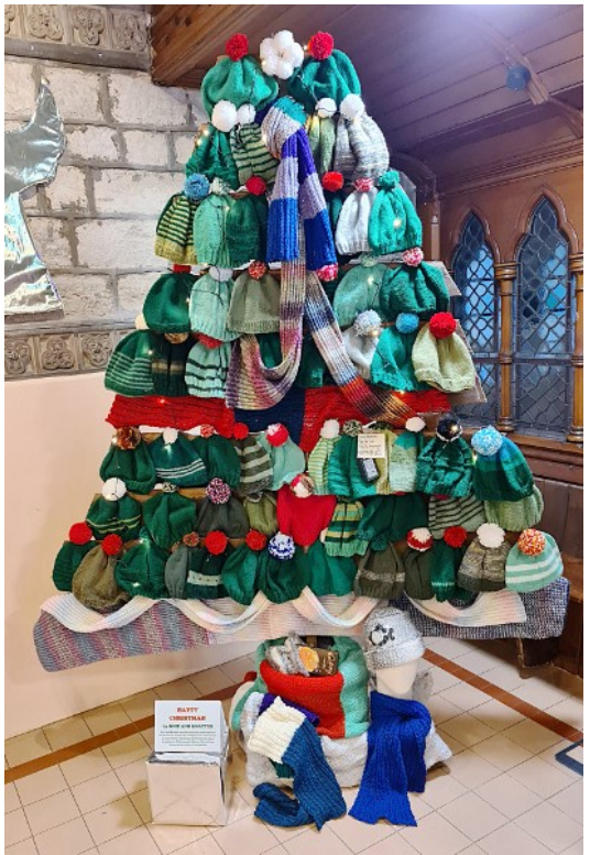
Hatty Christmas by Knit and Knatter (The hats will be donated to charity)