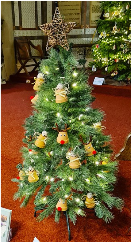
Cultivating Christmas (Decorations made from flower pots)