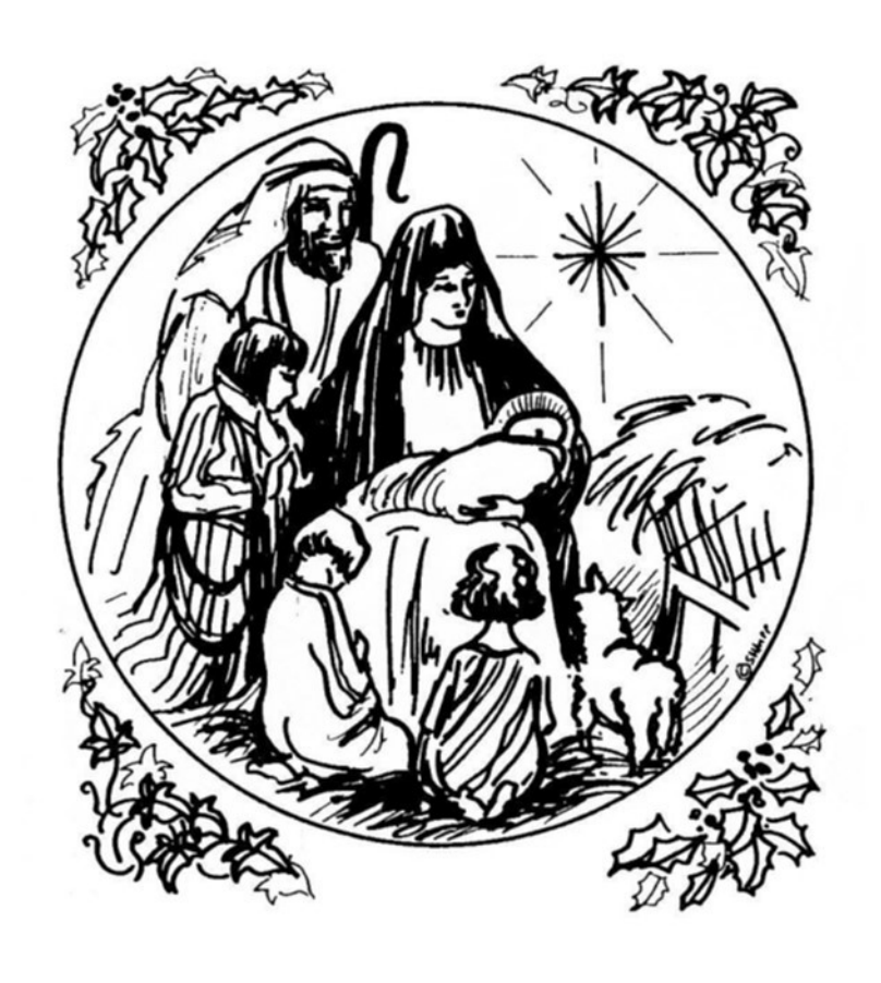
Emmanuel Church Sidcup Methodist and United Reformed