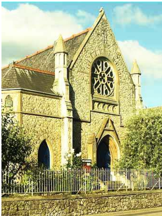
Emmanuel Church Sidcup