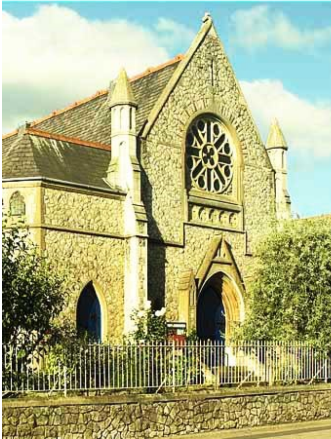
Emmanuel Church Sidcup Methodist and United Reformed